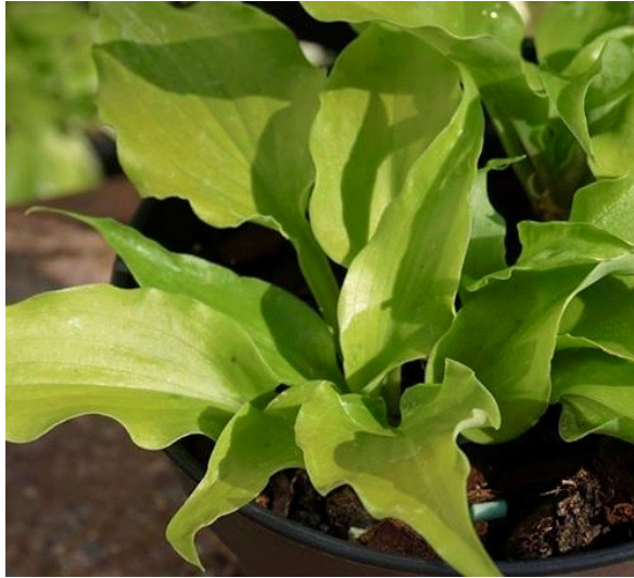
H. 'Funny Bones' Is One of the Many HOTYS for 2021.